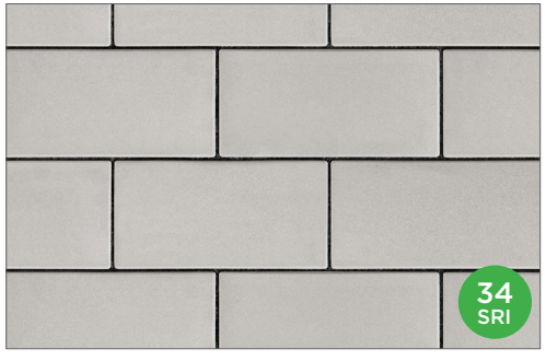
OPAL BLEND SMALL RECTANGLE BUNDLE ONLY