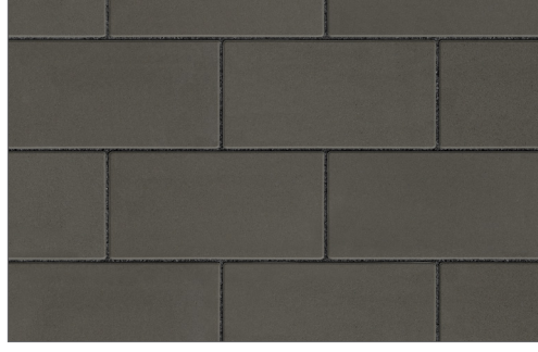
MIDNIGHT CHARCOAL SMALL RECTANGLE BUNDLE ONLY